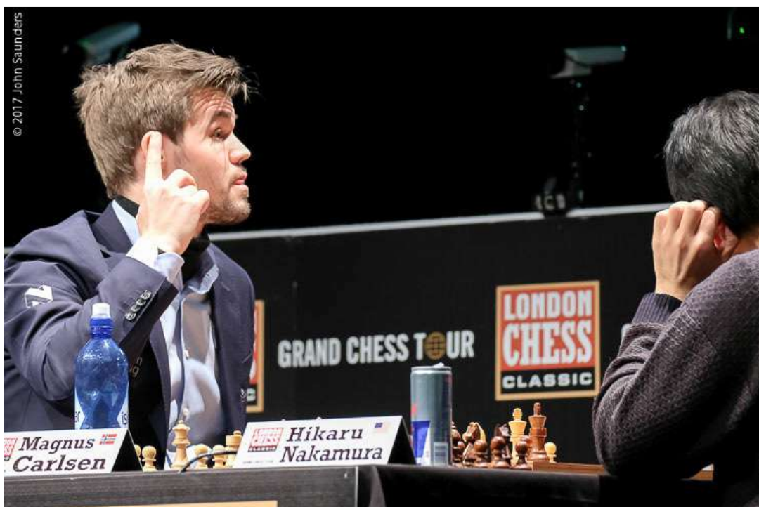
“Excuse me, Mr Arbiter?” A relieved Carlsen summons the arbiter to ratify his threefold repetition

that his long grinds would be better entitled ‘howdunits’. You know the scenario – one of those seemingly lifeless positions where you couldn’t imagine him having the remotest chance of beating anyone rated over 2700 but which he would nurse patiently until eventually forcing an error which he would pounce on and exploit. The joy is in trying to guess how he is going to do it. It happens less often these days, either because his rivals have got fed up with being a sort of Agatha Christie victim that gets brained with the lead piping in the conservatory and have become resistant to his murderous technique, or else (whisper it softly) he’s not quite as sharp as he was now he has reached the grand old age of 27.