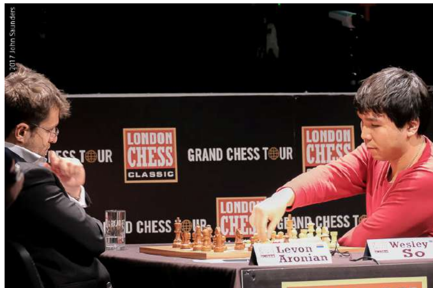
Levon Aronian was at his most creative against Wesley So

MVL versus tournament leader Fabiano Caruana had its moments, starting from a Petroff. Caruana told he was booked up to move 23. "I was optimistic and I thought I might be able to get better but it turned out to be nothing." With a full point lead he didn't have to press too hard, of course, but now has Nepo breathing down his neck.