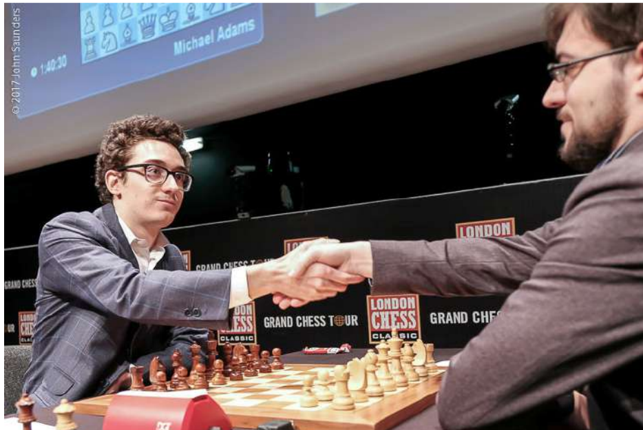
Maxime Vachier-Lagrave and Fabiano Caruana shake hands before the game

MVL versus tournament leader Fabiano Caruana had its moments, starting from a Petroff. Caruana told he was booked up to move 23. "I was optimistic and I thought I might be able to get better but it turned out to be nothing." With a full point lead he didn't have to press too hard, of course, but now has Nepo breathing down his neck.