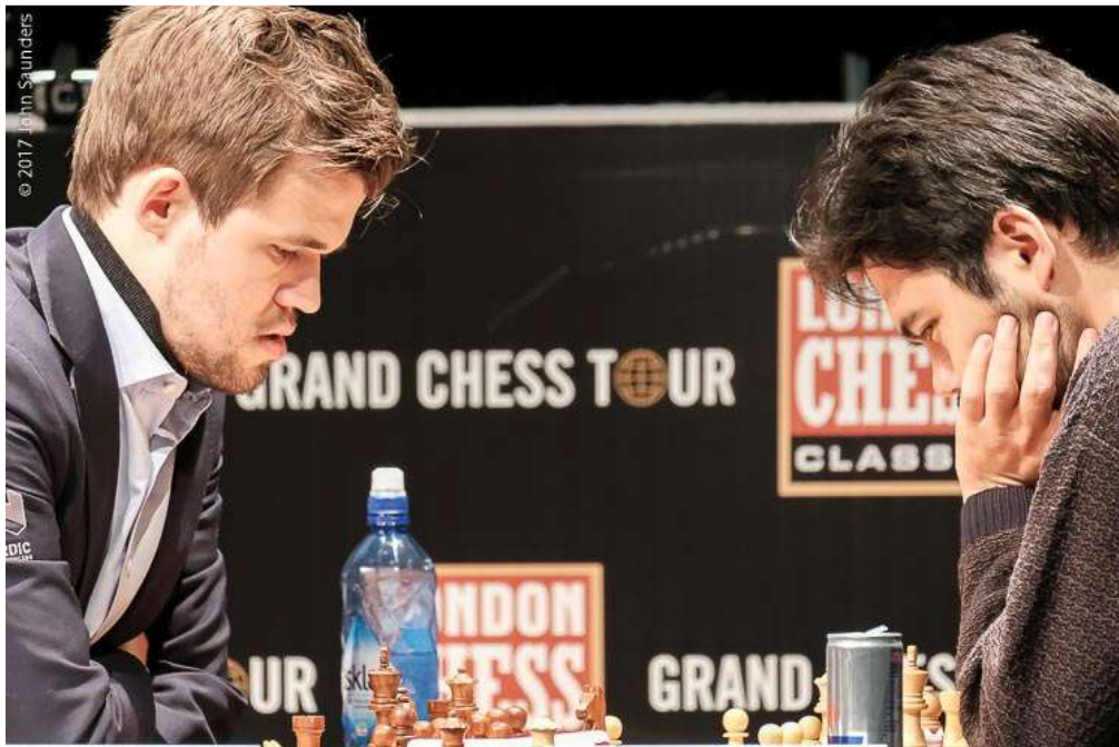
Carlsen, suffering from a cold, goes head to head with his old rival Nakamura