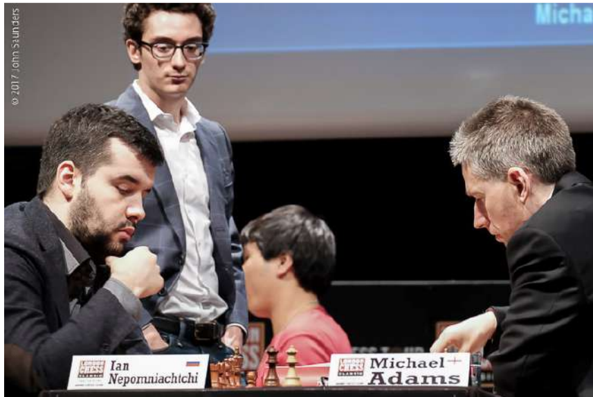
Mickey Adams was ground down in a rook and pawn endgame by Ian Nepomniachtchi

Adams-Nepomniachtchi was decisive but somewhat less exciting than the Nakamura-Carlsen roller-coaster. Adams was doing OK until his 36th move which cost him a pawn. Even so he reached an endgame a pawn down but with the pawns all on the same side of the board, which tends towards a draw. Super-GMs in this event have been defending pawn deficit endgames so regularly that we are getting blasé about them, but Nepo redressed the balance with a cannily played endgame perhaps more akin to those former Carlsen grinds where he would make something out of nothing. His finish was crisp.