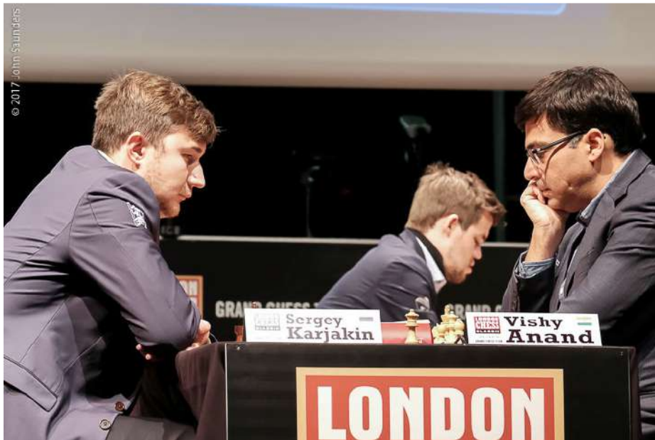
Vishy Anand was surprised in the opening by Sergey Karjakin