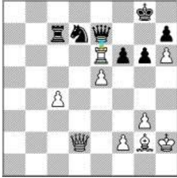
Pichot, Alan - Villanueva, Mario [C18]

16.bxa3 Tb8 17.Cg4 Cd4 18.Cxd4 cxd4 19.Ch2 Db6 20.Dg4 Da5 21.Cf3 Dc3 22.Ag5 Axa3 23.Rh2 Tfe8 24.Ad2 Dc5 25.Cg5 De7 26.Df4 Tf8 27.Cf3 Ab5 28.Cxd4 Ab2 29.Cxb5 Axa1 30.Ab4 Dd8 31.Txa1 Txb5 32.Axf8 Dxf8 33.Txa4 Tb7 34.Ta6 Tc7 35.Td6 Ta7 36.c4 dxc4 37.dxc4 Tc7 38.Dg5 f6 39.Dd2 De7 40.Txe6 1-0